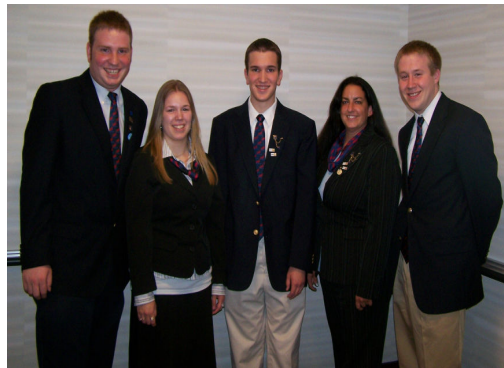
2007-2008 State Executive Council