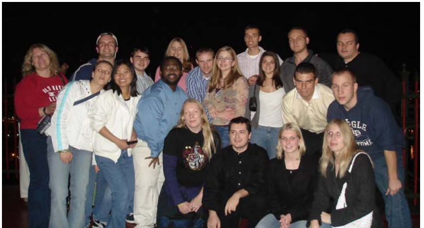
PA PBL Social event at Duquesne Incline. Includes NY PBL and ME PBL.