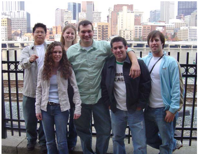
Alvernia College at the NFLC

The Alvernia College chapter recently began planning for their winter service project. As part of Christmas on Campus, an event sponsored by the Student Government Association, the chapter will be assisting underprivileged, migrant children to write holiday greetings to elderly individuals residing at Berks Heim, a local nursing home. After the event takes place and the greeting cards are written, members of the chapter will visit the nursing home to personally deliver the cards and spread the joy of the season through singing carols. Alvernia's chapter has continuously worked toward meeting the needs of its members. The 2005-2006 Alvernia College chapter has established itself as a service-driven organization and will continue to foster professionalism within its members throughout the year.